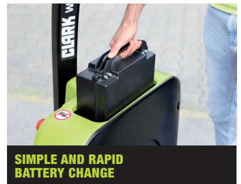
SIMPLE AND RAPID BATTERY CHANGE

Intermediate charges can be used to avoid downtime for recharging the battery. The Li-Ion battery thus ensures maximum availability. No gases are released when the Li-Ion battery is charged. Therefore, there is no need for ventilated charging rooms. Exchangeable batteries and additional external chargers are also available.